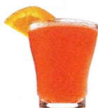
THE HAMPTONS GIRL SUNSET SPRITZ

Sex on the Beach is so cliché. Woo her by mixing one of these drinks instead, courtesy of the nation's hottest beach bars.